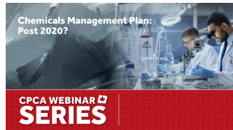
CPCA Webinar: Chemicals Management Plan: Post 2020?

The paint and coatings industry is forward-looking. CPCA seeks to have 20-20 vision for the challenges and opportunities ahead!