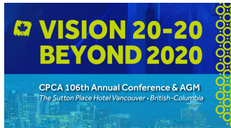
CPCA 106th Annual Conference & AGM

The paint and coatings industry is forward-looking. CPCA seeks to have 20-20 vision for the challenges and opportunities ahead!